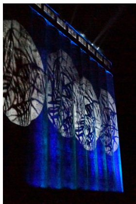
Photos from Buffalo Grain Elevator Lighting Demonstration, September 2012

The Erie Canal Harbor Development Corporation retained Foit-Albert Associates, in collaboration with Canadian-based Ambiances Design Productions, to prepare a master plan outlining the phasing and implementation of multi-media projections at selected grain elevators and bridges along the Buffalo River in the City of Buffalo, New York.